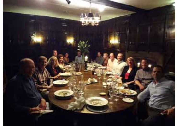
RFA members enjoy traditional British fare at the George Hotel.