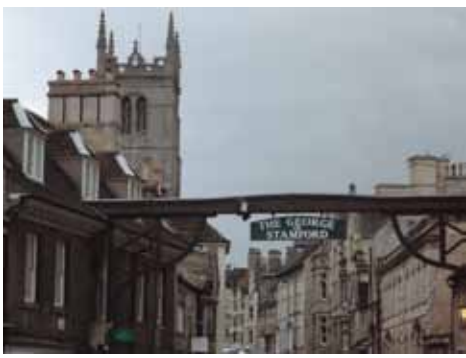
Attendees are served delicious quiche and other refrigerated products during a visit to Pork Farms.